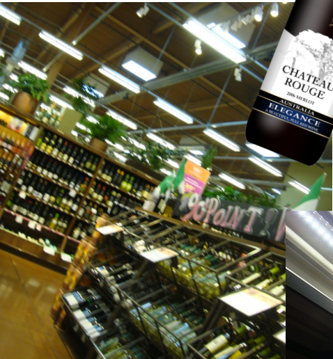
Wine in stores are usually stored under fluorescent lighting which plays a part in Light Strike. AoTuroaLED kits retrofit fluorescent quickly to fix this problem.

Come visit www.AoTuroaLED.co.nz , our lighting specialist will show you how we have solutions to retrofit fluorescent lighting. And so now to all the wine enthusiasts - over that next Pinot Noir or Chardonnay - educate your friends on “light strike” and teach them to look up and notice what type of lighting is used... and then give AoTuroaLED a go!